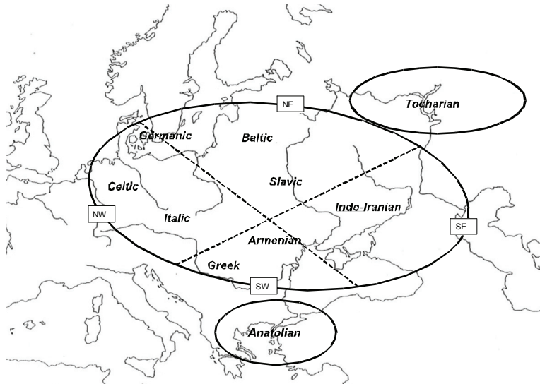
Figure 2. IE languages and dialects in the middle of the 3 rd millennium BC. The map is schematic and locations should not be interpreted as precise. Circles indicate separate languages. Units within the large circle represent IE core dialects but the transition to separate languages had started. Language names should properly be prefixed by something like “pre-proto-” but this is omitted for simplicity’s sake. For the four ‘quadrants’ see main text.

IE dialect division based on the CT hypothesis. It should be able to explain all relationships between the IE branches as we know them. The scenario presented here certainly isn't perfect but it's a start and I think it best to present it by showing a hypothetical map (Figure 2) of IE languages and dialects from the middle of the 3 rd millennium BC.